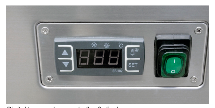
Digital temperature controller & display